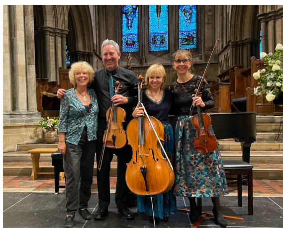
The Orsay Piano Quartet

During July the church rejoiced in hosting a series of marvellous concerts by some of the finest performers in the UK and beyond during the 2022 JAM on the Marsh Festival , which has become an annual tradition to which we look forward with considerable eagerness again later this coming July.